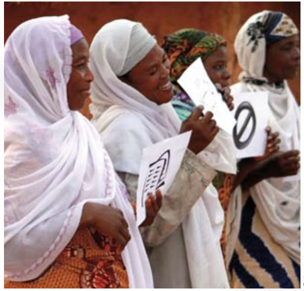
Participants learn the meaning of key health insurance terms and create ways to remember them. Field test of Freedom from Hunger's technical learning conversation focusing on health microinsurance in Ghana.

Important information on use and effectiveness can be extracted through qualitative research based on client interviews, focus group discussions, and financial diary analyses. However, assessing the impact of education programmes on behaviours and well-being requires practitioners to apply experimental research methodologies such as randomized control trials that measure the impact of the program using treatment and control groups. This type of research might seem challenging (not least due to the financial implications of conducting such rigorous research), but it is possible, and often necessary to understand the effectiveness of different education approaches and convince stakeholders to invest in consumer education.