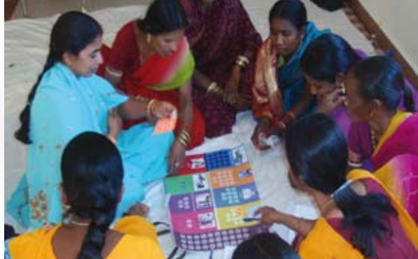
Women in India using CHAT to brainstorm on their needs for health microinsurance

the value of insurance for low-income households. They are produced in the community and include local vendors and community members as actors. CNSeg also solicited community feedback to develop new scripts. CNSeg feels that this participatory approach will help develop trust within the community and encourage members to internalize messages.